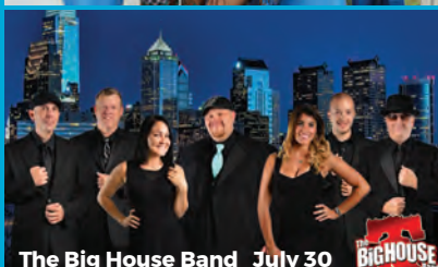
The Big House Band July 30