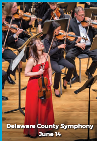
Delaware County Symphony June 14