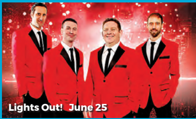
Lights Out! June 25