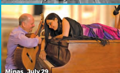
Minas July 29