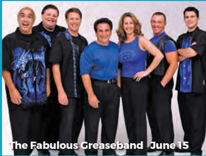
The Fabulous Greaseband June 15